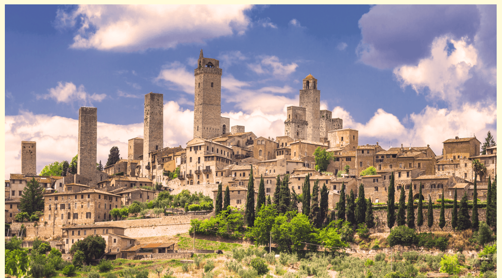
The Beautiful Hidden Gems of Tuscany

A RICH COMBINATION OF MEDITERRANEAN SEAFOOD COOKED IN A SAFFRON TOMATO SAUCE WITH CHILLI AND GARLIC £17.95