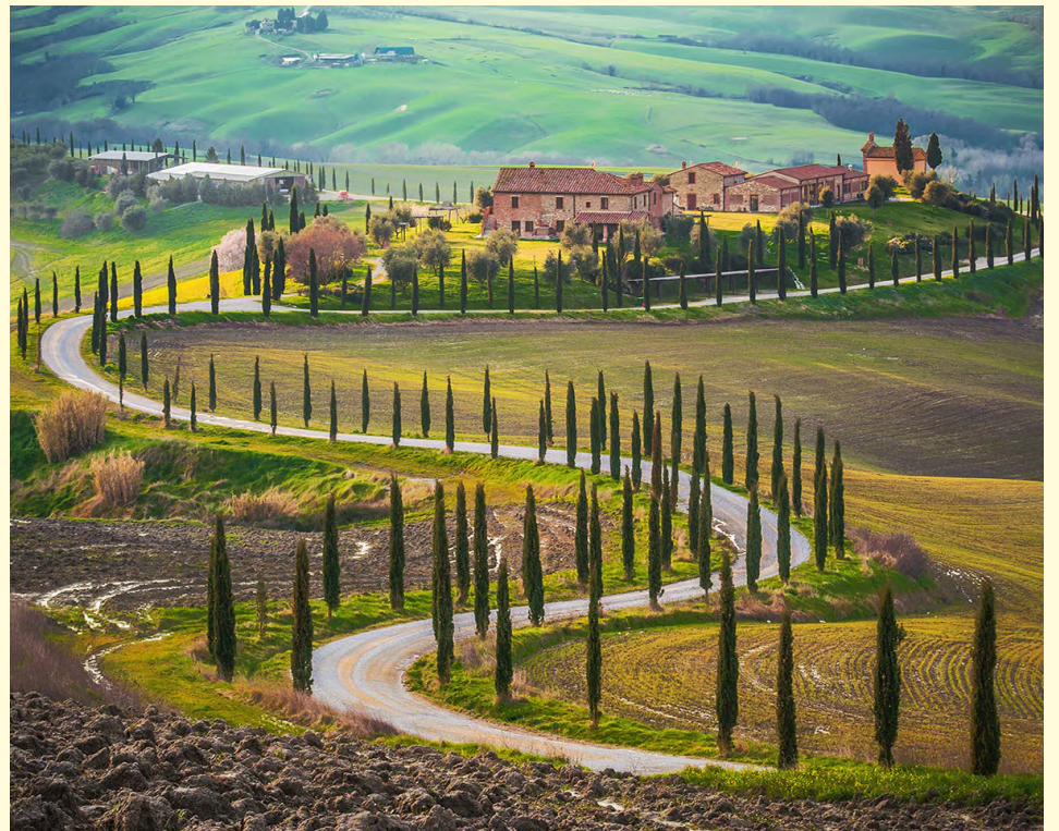
Tuscany: Embark On A Journey Through The Iconic Tuscan Countryside

PAN FRIED CHICKEN BREAST IN A CREAMY MUSHROOM AND MUSTARD SAUCE SERVED WITH ITALIAN RICE £16.95